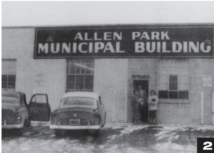
This picture taken in 1954 shows the Allen Park Municipal Building located on Roosevelt Street

Sometime prior to WWII, we moved to the cinder block building located on Roosevelt just South of Southfield. Our 24th District Court is located there today. Photo number two and three shows this building, which housed the police, fire, municipal offices and the DPS. When we outgrew that location, we moved to a former hardware store on Allen. See photo four, which was taken in May 1963 during Heritage Day and Michigan Week. Omer O'Neil is pictured standing on the left side and Mayor Morrison from Kalamazoo is on the right. The American Legion stands on this location today.